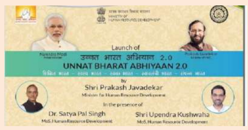
HRD Ministry launches second edition of Unnat Bharat Abhiyan

https://www.jagranjosh.com/current-affairs/hrd-ministry-launches-second-edition-of-unnat-bharatabhiyan-1524712136-1